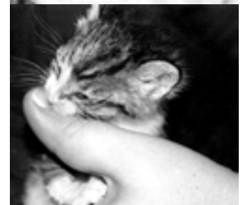
Sugar Bear sleeps & plays with one of his special volunteers