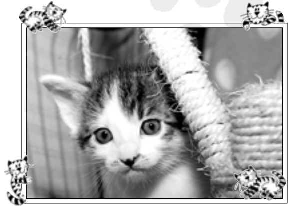
RESQCATS "Cutest" – WABBIT "Got Milk?"