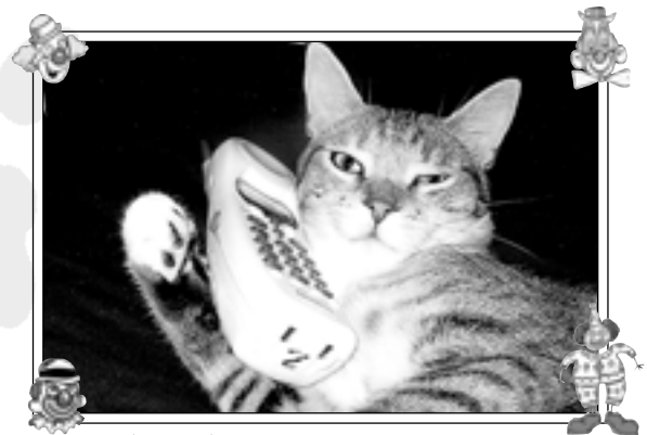
RESQCATS "Funniest" – TEXAS TOM