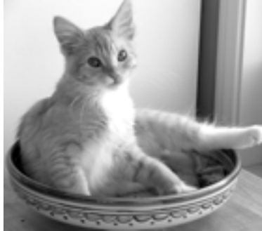
Razzle (formerly Sammy)

I have to send you a couple of photos of "Razzle Dazzle." He is the perfect kitty. He has a great personality and it didn't take long for us to find a place in our hearts for him. I am sure you've heard a million stories of how entertaining kittens are, so I won't bore you with all the details. All I can say is we love this little guy.