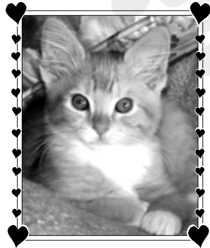
RESQCATS "Sweetest" – RAZZLE DAZZLE