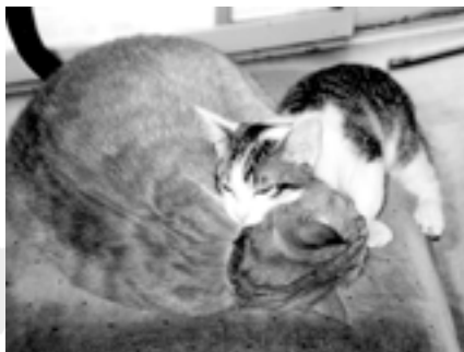
Duke & Violet