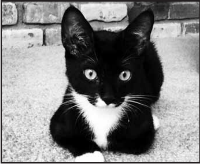
"Banksy" in his new home

few days, they showed signs of ringworm. They were bathed every other day for three weeks and treated with a topical medication three times a day. Bedding was changed daily, their litter box was dumped every day and all precautions were taken to not spread the fungus spores to other cats. Enclosures on each side had to remain vacant for three weeks to ensure the fungus was contained,