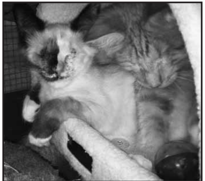
"Winkin" and "Blinkin" at RESQCATS

Their medical care was over $3400. I am grateful to so many who sent support in the form of donations to help cover some of the expenses. And I thank others who shared such kind words of love and understanding. When kittens like Blinkin and Winkin come to RESQCATS I welcome them as I know their fate could have been immediate euthanasia if they