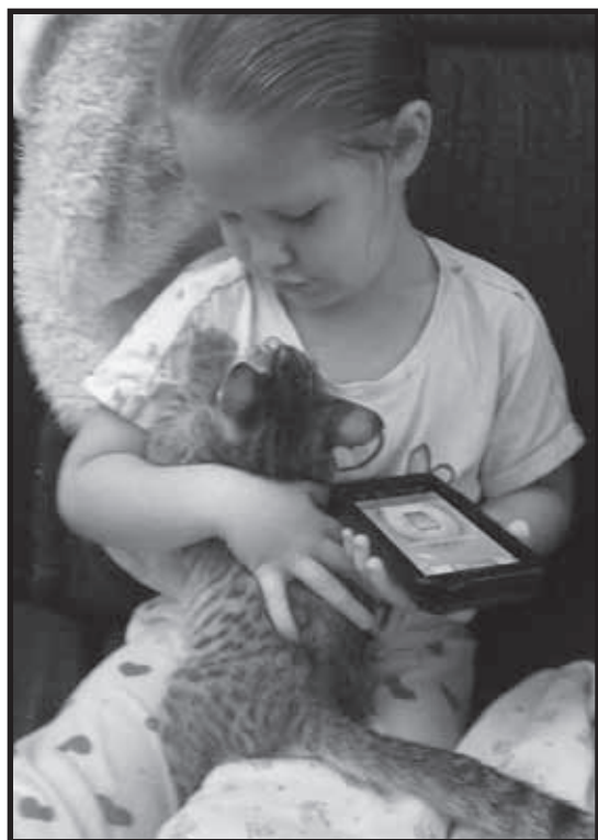
"Franklin" in his new home

You never soar so high as when you stoop down to help a child or an animal.