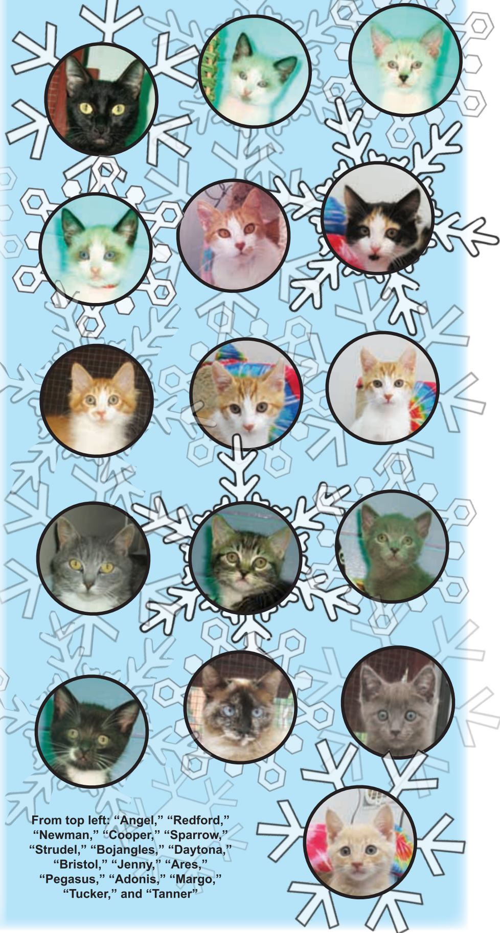
From top left: "Angel," "Redford," "Newman," "Cooper," "Sparrow," "Strudel," "Bojangles," "Daytona," "Bristol," "Jenny," "Ares," "Pegasus," "Adonis," "Margo," "Tucker," and "Tanner"