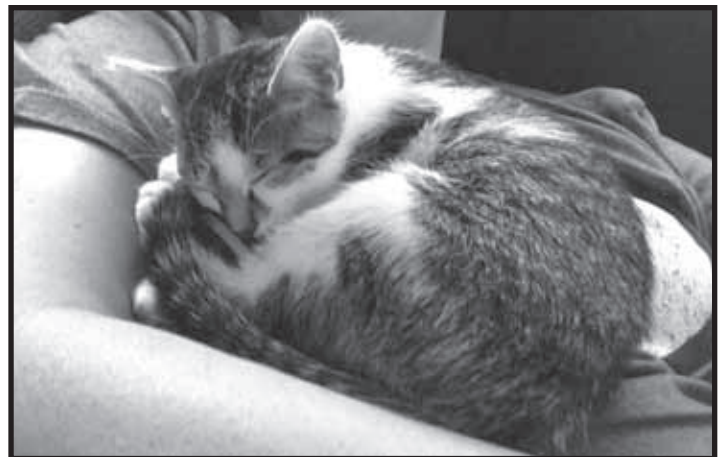
Another happy RESQCATS kitty: “Harley” in his new home