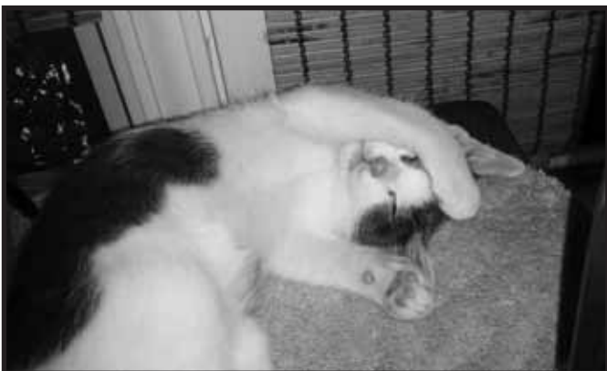
"Pop" in his new home

I am proud to state that we tackled every challenge with the help of the veterinarians, eye specialists,