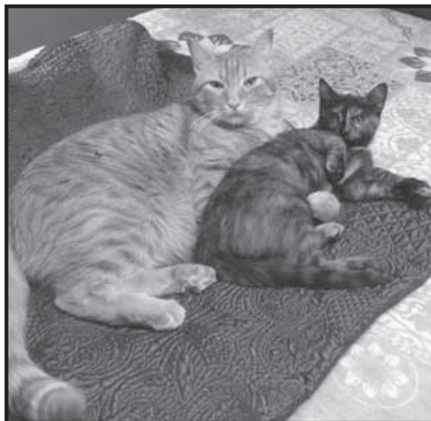
"Packer" with her new buddy, Brewer, in her new home