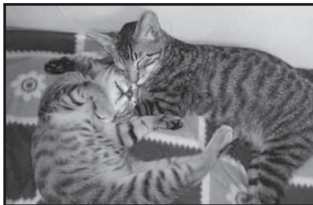
"Chaise" and "Cowboy" in their new home