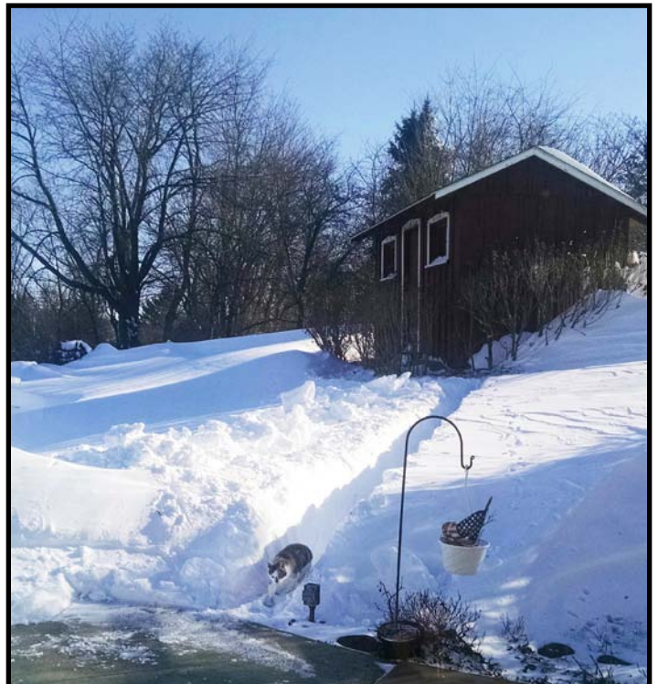
The “feral cat path” at Gladys’ house.

Footnote: All Gladys’ feral cats lived 16 or more years. One remains and she is 18. Gladys’ house was sold “as is” which means this included one cat. The buyers, who also own the adjacent property and knew Gladys, readily agreed. We left them plenty of cat food.