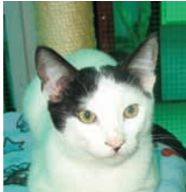
Braveheart is a new RESQCATS resident cat