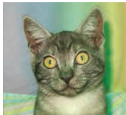
Slate adopted by Tamarind Harmon who also adopted Perla