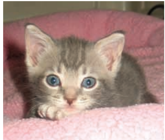
Pocket "Wishes everyone a Happy Holiday!"

WE ARE PROUD TO DONATE OUR TIME & DESIGN SKILLS TO SUCH A WORTHY CAUSE!