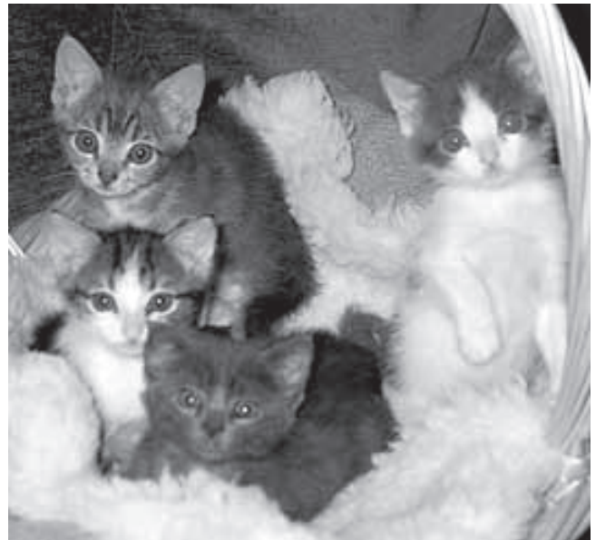
A foster litter... it would be hard not to get attached to these! (These were fostered in Fall of 2008)

My next foster kitten was Pocket. He was a male kitten that had lost two siblings already. They came from a litter of 5 and had been born with neurological issues. They had difficulty walking and balancing. The two bigger brothers gradually they grew out of the condition, but Pocket was not doing as well. He was so tiny and could not walk. When he tried, he would topple forward as his head was bigger than the rest of his body. I taught him to walk by creating a harness out of gauze and tying it under and around his belly. I hand fed him and did basically everything I could think of to