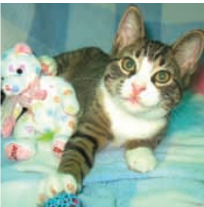
Fortune , now Phineus adopted by Peggy Rogers