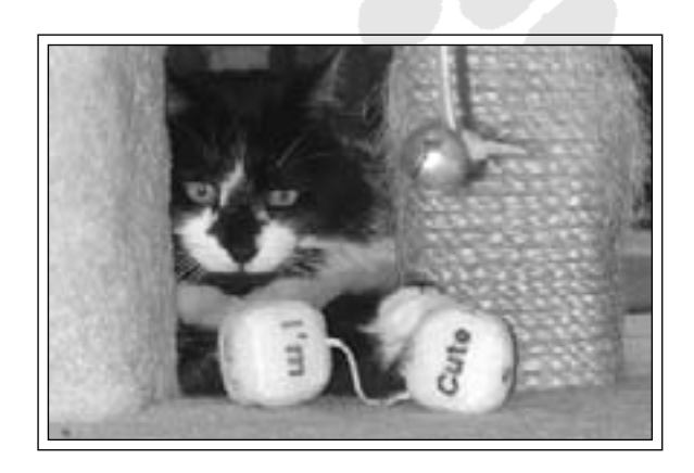
RESQ(ATS "The (utest" - WIZARD Wizard has many guardians as a resident at RESQCATS.