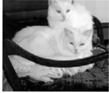
Snow & Shadow

Enclosed are some new pictures of "Snow" and "Shadow." I cannot begin to tell you how much I love my