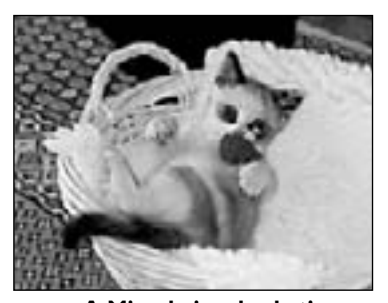
A Miracle in a basket! See story on page 3