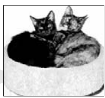
Snoop & Newton

We absolutely love our two kitties so much. They have added such warmth and life to our home. Each day, they