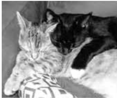
Bella & Billy

I wanted to let you know how well and happy Bella is. She has gotten so much bigger since we brought her home. I feel like she was put on this Earth just for us because she is the most lovable cat. She follows me wherever I go unless, of course, she and "Billy" are napping.