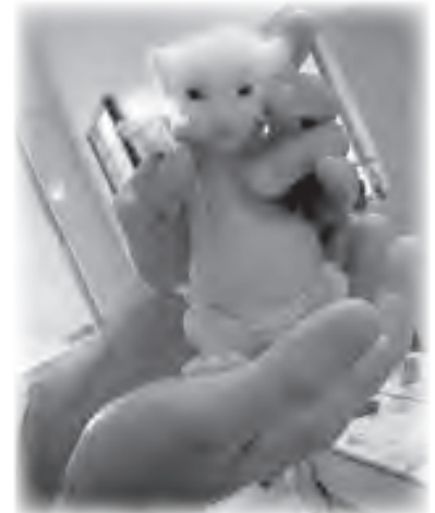
He looked like a baby Polar Bear when we found him.

The love, compassion that she and her volunteers have for the cats and all the hard work they do is nothing short of amazing. RESQCATS mission is to rescue, care for and adopt stray and abandoned cats and kittens. That statement resonated so much with me that I knew I wanted to continue volunteering any and every time I could. Halfway through my first season at RESQCATS I decided that I wanted to do more than just socialize. I asked to "up" my duties and to get into the nitty gritty by being one of the morning volunteers who help clean the cattery. The answer was yes, so I went about cleaning enclosures on those early mornings and then spent time with the kittens and all the resident cats, too.