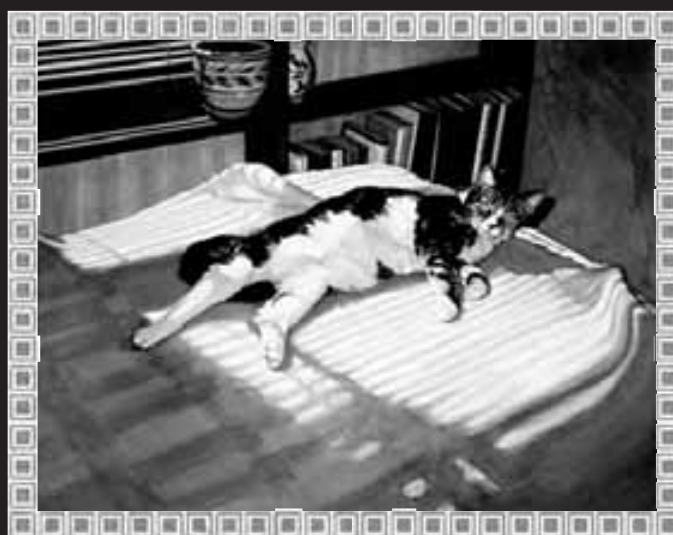
"In the Afternoon Sun"