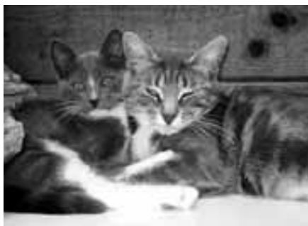
Benny & Luna

“ Benny ” and “ Luna ” (aka KC and Blaze ) continue to blossom and thrive in our home. Benny is still a mama’s boy. He cracks us up with the way he jumps for his toys and stretches out on the floor waiting to be petted when we get home. Luna (also nicknamed Mama) is blossoming more and more everyday and is starting to sleep at the foot of our bed with us.