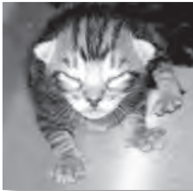
One of the 4 kittens born March 19, 2011