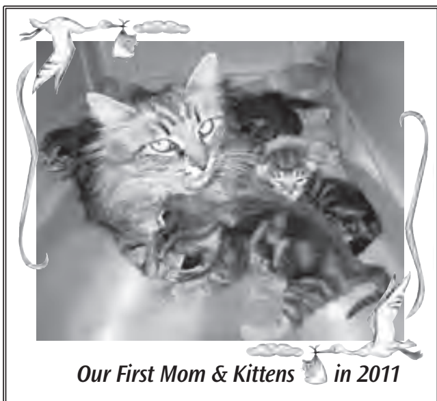
Our First Mom & Kittens in 2011

(See a close-up photo of one of her newborns in the Family Photo Album page 6).