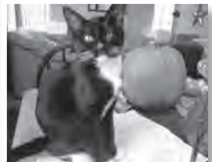
Stash was adopted by Sophia Benevides in 2010