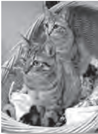
Promise & Journey are watching for the purrfect person to walk in the door!