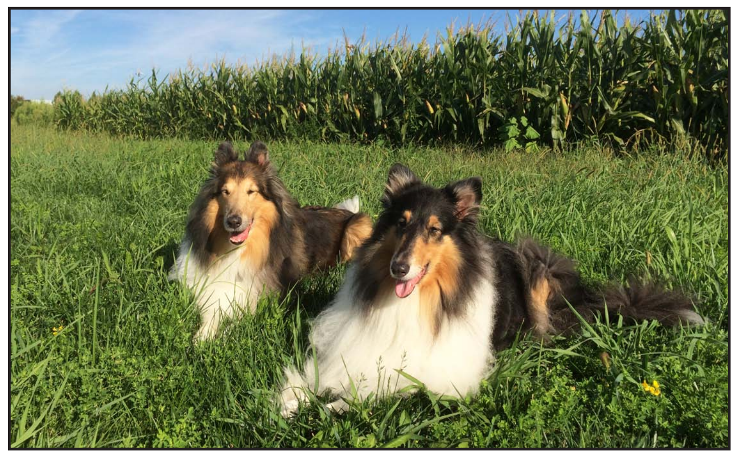
"River" and "Fantasy" have joined the family!