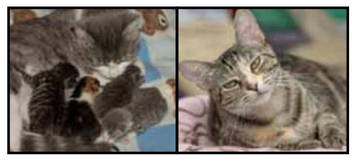
"Crystal" with her kittens and "Sally"

euthanasia when they can find a rescue to take them on. Crystal gave birth to four beautiful kittens here and Sally had six just two days after she arrived at RESQCATS!