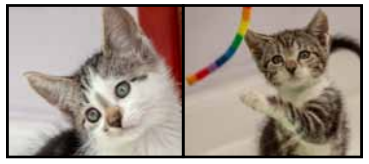
"Candice" and "Darlin"

Darth, Willow, Bamboo, Lucas and River were being sold on Craigslist. RESQCATS offered to cover all the expenses for their mom including vaccinations, a test for Felv/FIV, spay surgery and micro-chip in return for relinquishing the kittens to RESQCATS so that we could make sure the kittens were not sold or given away without medical attention (including spay and neuter surgeries!).