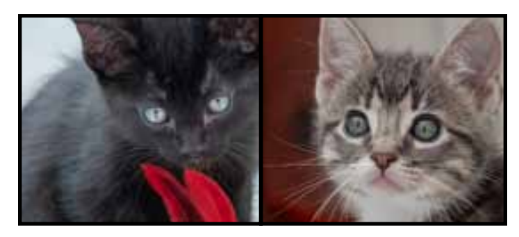
"Poppyseed" and "Chia"

place free of predators, cars and all the dangers that kittens encounter when they are born in the streets, under bushes, behind sheds, under cars and other despicable and dangerous places.